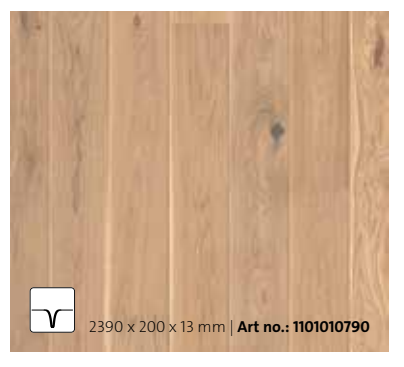
R03 | Oak light beige | plank | expressive brushed/white/natural oil-treated