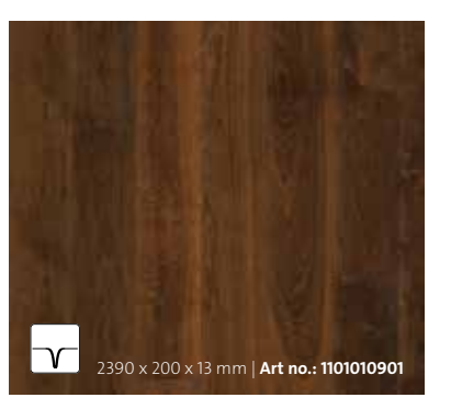
R04 | Oak dark brown | plank | expressive smoked/brushed/natural oil-treated