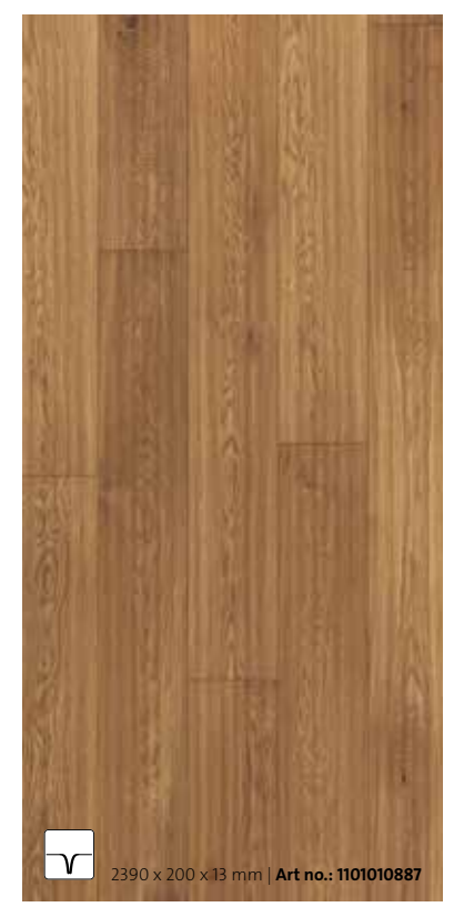
R11 | Oak alpine beige brown | plank expressive | sculptured/brushed/ coloured/natural oil-treated