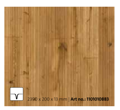
R02 | Oak alpine | plank | expressive sculptured/brushed/natural oil-treated