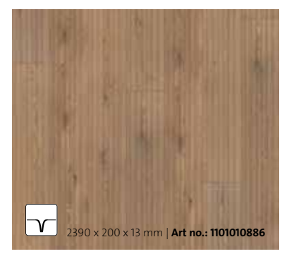
expressive | sculptured/brushed/ coloured/natural oil-treated