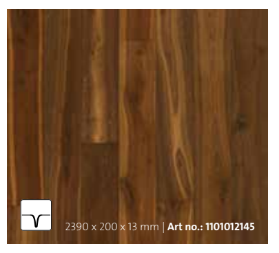
R07 | Oak tobacco brown | plank expressive | smoked/brushed/natural . oil-treated