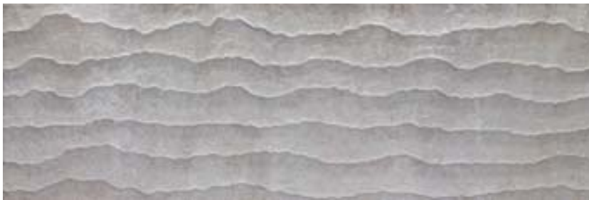
CONTOUR GRAY 33.3x100 cm (x12 mm) 13"x39 1/2" V1440169 - 100161520 - G271 Butech recomienda junta Recommends joint colorstuk rapid n cemento B22502004 - 100004297

CONTOUR En la colocación, las flechas de la parte posterior deben de apuntar siempre hacia arriba If there are arrows on the back of the tiles, these should be laid pointing upwards