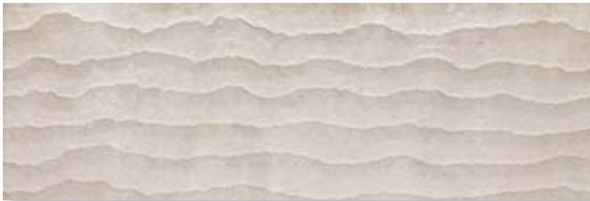
CONTOUR BEIGE 33.3x100 cm (x12 mm) 13"x39 1/2" V1440165 - 100161475 - G271 Butech recomienda junta Recommends joint colorstuk rapid n beige B22502016 - 100004308