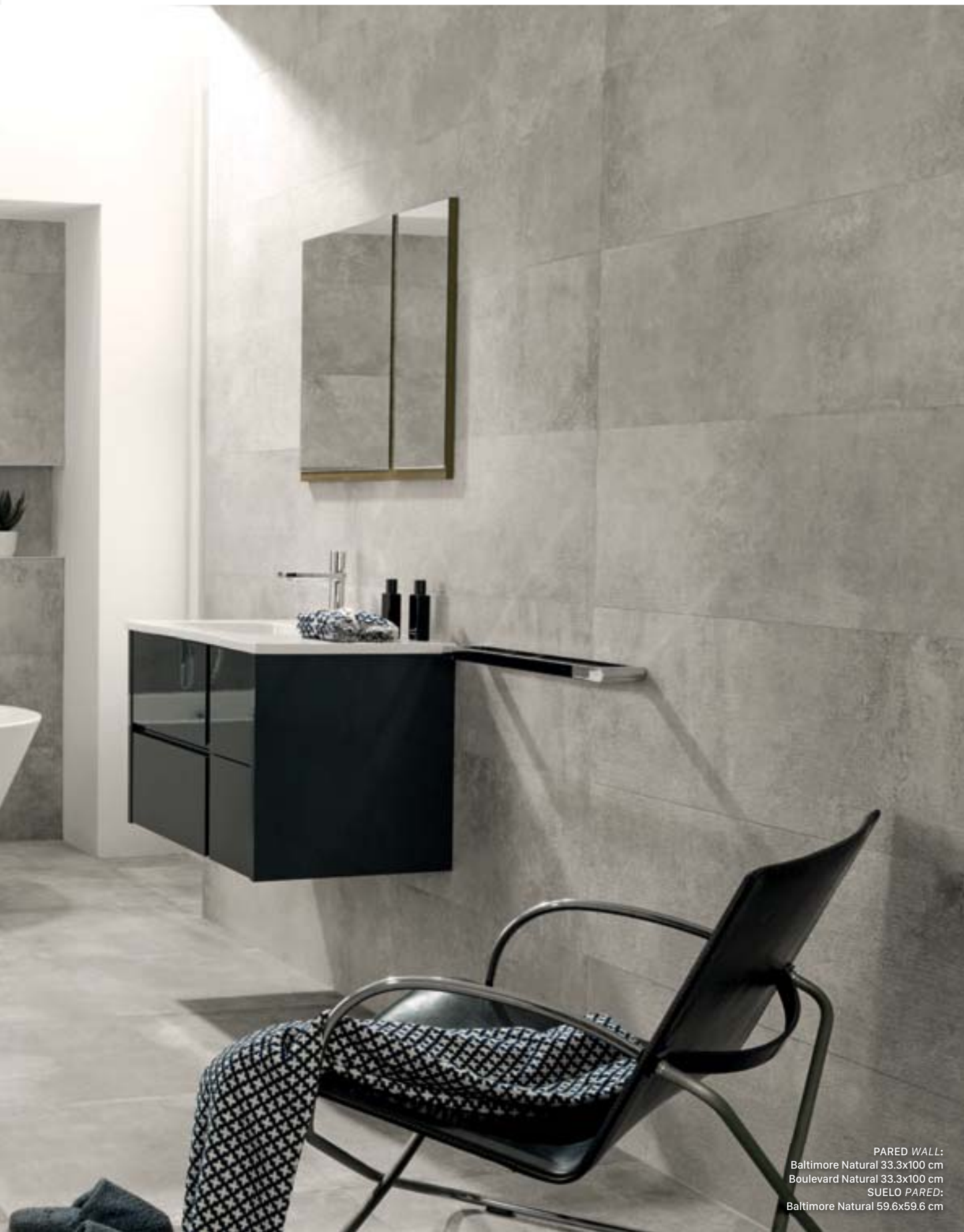
PARED WALL: Baltimore Natural 33.3x100 cm Boulevard Natural 33.3x100 cm SUELO PARED: Baltimore Natural 59.6x59.6 cm