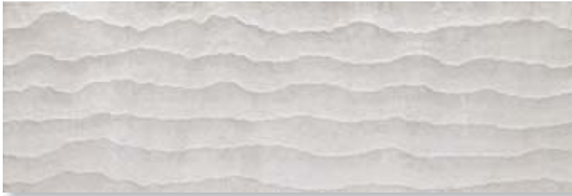
CONTOUR WHITE 33.3x100 cm (x12 mm) 13"x39 1/2" V1440180 - 100161691 - G271 Butech recomienda junta Recommends joint colorstuk rapid n blanco B22501001 - 100004294