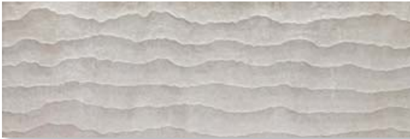
CONTOUR NATURAL 33.3x100 cm (x12 mm) 13"x39 1/2" V1440176 - 100161498 - G271 Butech recomienda junta Recommends joint colorstuk rapid n manhattan B22502002 - 100004295