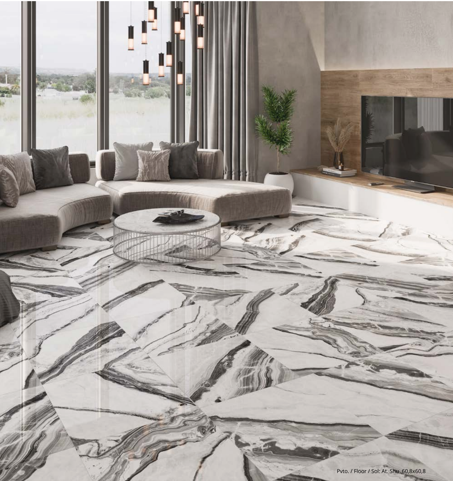
Pvto. / Floor / Sol: At. Shu 60,8x60,8